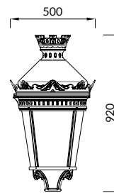
CHENONCEAUX III Post top