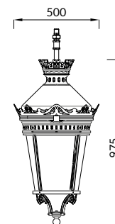
CHENONCEAUX III Suspended